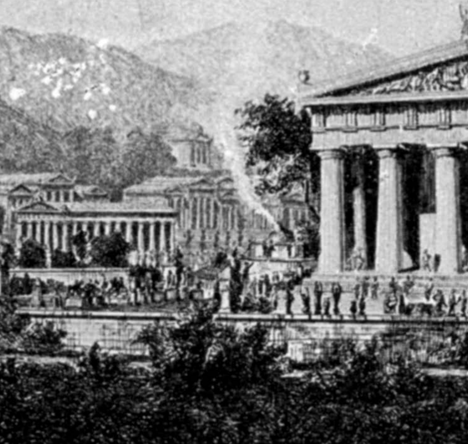
Figure 1 (this page): Restored view of the Temple of Zeus at Olympia, Greece. Source: Wilhelm Lübke, Max Semrau: Grundriß der Kunstgeschichte. Paul Neff Verlag, Esslingen, 14th edition 1908. Source: Wikimedia Commons .