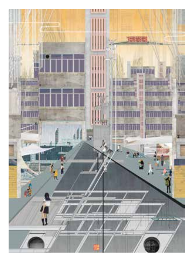
Figure 7: A girl gets lost on the crowded street. She finds a thing in between a narrow slit, something old and raw. Smells woody and display letters without screen and light, a book.