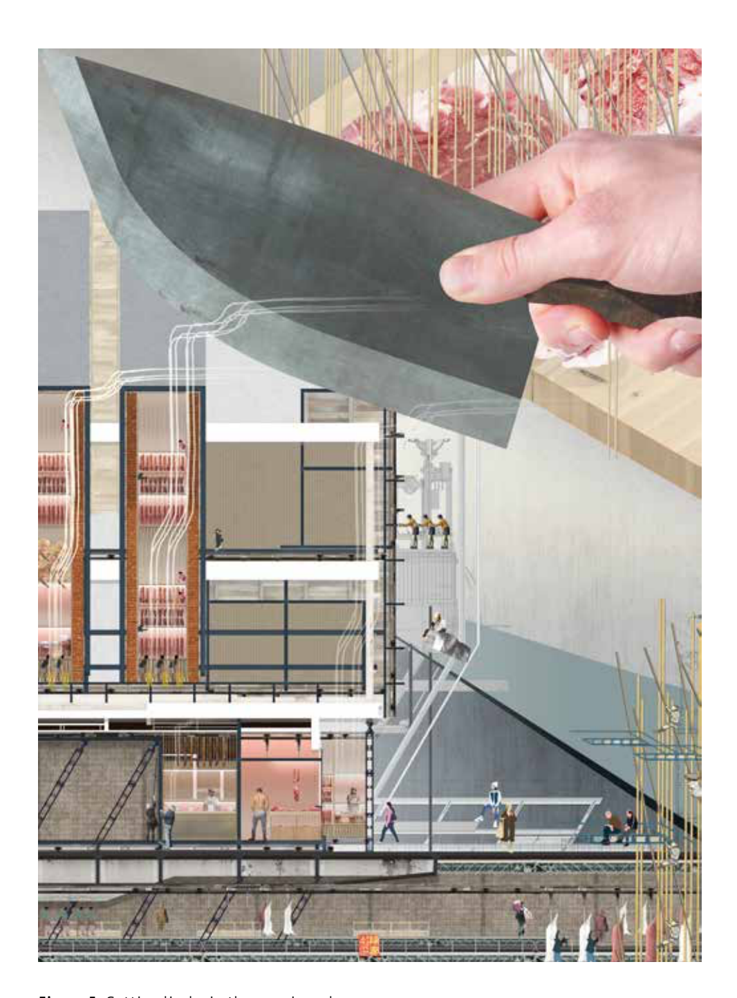
Figure 5: Getting lively, in the morning, chopping sound and the street, sounds of metal crafting. After the market is operating for a certain time, sitting devices emerge. Elderly sit, relax and wait for friends. Kids stand on it for fun.